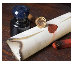
DICIONNAIRE ENCYCLOPEDIQUE DES SCIENCES MEDICALES V. 85

Available link of PDF Dictionnaire Encyclopedique Des Sciences Medicales V15